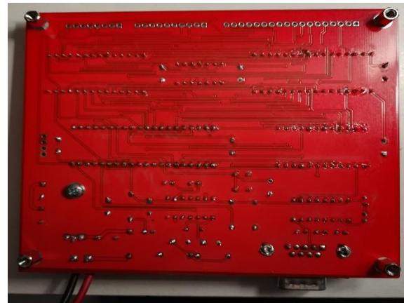
PCB Bottom View