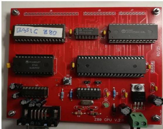
PCB Top View